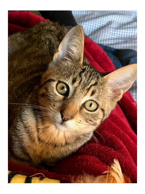
How we got from there to here...

She's possessive, very loving and demands all the attention and toys.